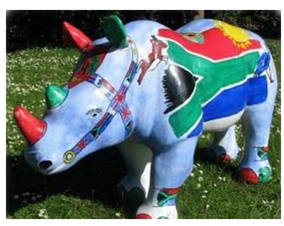
ART: A rhino sculpture, decorated by our pupils with designs from our partner school in Cape Town