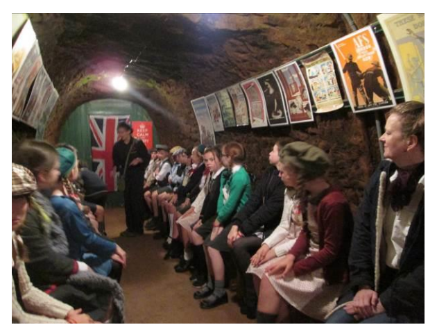
HISTORY: WW2 brought to life for Year 6 at Stockport Air Raid Shelters