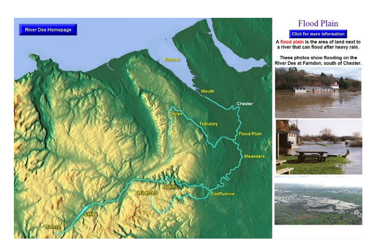
GEOGRAPHY: Our own River Dee website, used in high schools to support GCSE work