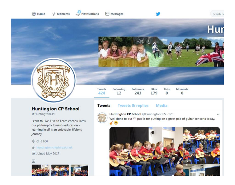
Keeping in touch: our Twitter feed

Visits to main school will be organised for new starters, and new parents will be invited to a meeting at which full details will be given.