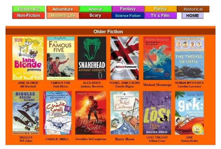
Our online library: inspiring reading

Reading: Our aim is for all children to enjoy books and to become confident, independent readers. The reading development of younger children is supported through the use of a structured scheme and book collections banded according to level of challenge. The school also teaches phonics (sound/letter pattern relationships) through a cross-class ability-group programme, catering precisely for pupils' needs. Guided reading sessions take place daily in all classes, and through curriculum work children encounter a wide range of genres, both fiction and non-fiction. All children are encouraged to use the school's extensive, modern library facilities each week, comprehensive supported by а catalogue of all our book stock, featuring website links and suggestions for further reading.