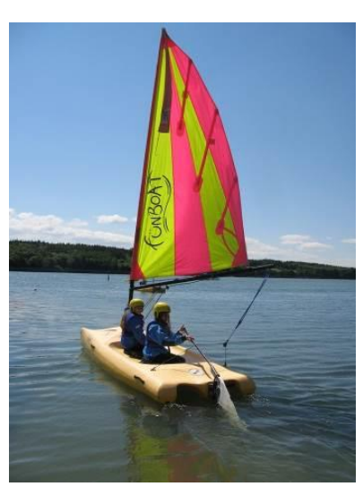
Year 5/6 residential visit to the Conway Centre