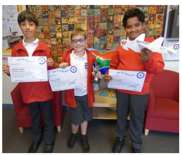
DESIGN & TECHNOLOGY: National finalists in the Bloodhound 'Fly to the Line' competition (2018)