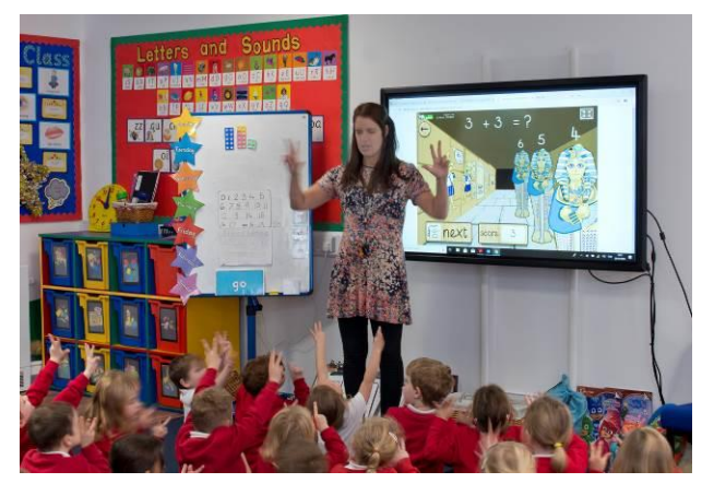
All classrooms are equipped with interactive display panels, and the school has a modern computer suite.

The school is set in extensive and secure grounds. Facilities for physical activity include two large fields, a junior playground sub-divided into separate areas for 5-a-side football, netball/basketball and quieter games, adventure play areas and an outdoor classroom. The EYFS and KS1 classes have their own separate playground, and a large covered area to enable outdoor activity in all weather.