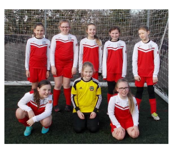
SPORT: Girls' Football, Cheshire Finalists (2018)