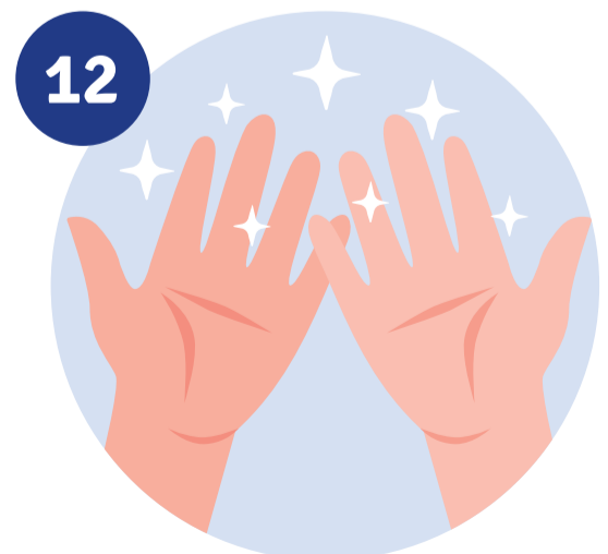
Your hands are clean