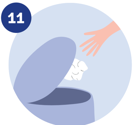
Put paper towel in pedal bin