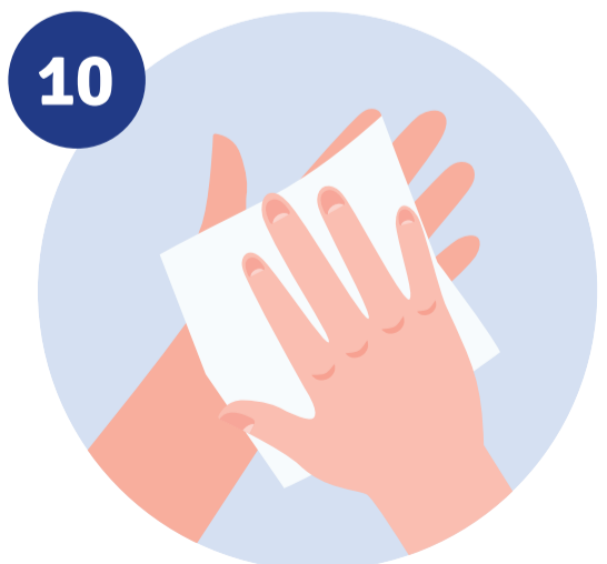
Dry with paper towel