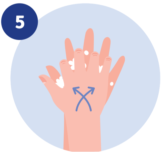
Scrub between fingers