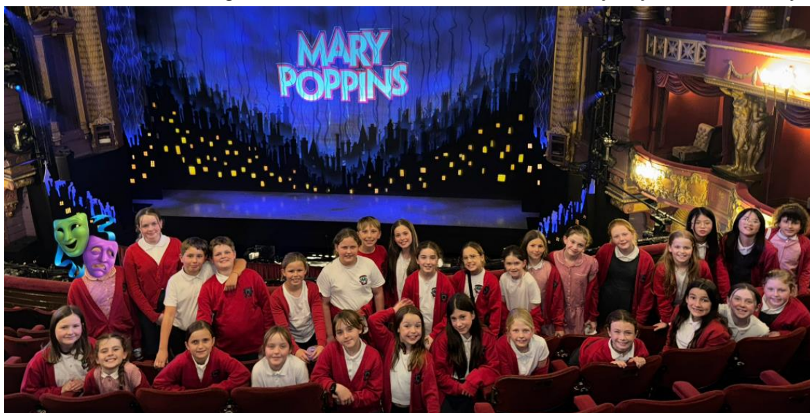
Musical Theatre Club's visit to see Mary Poppins