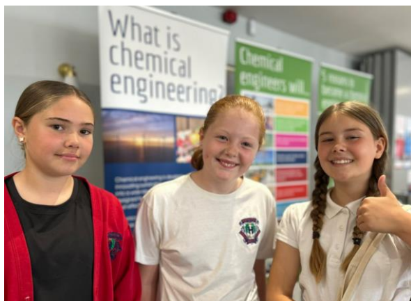
Passion for Learning Careers Carnival