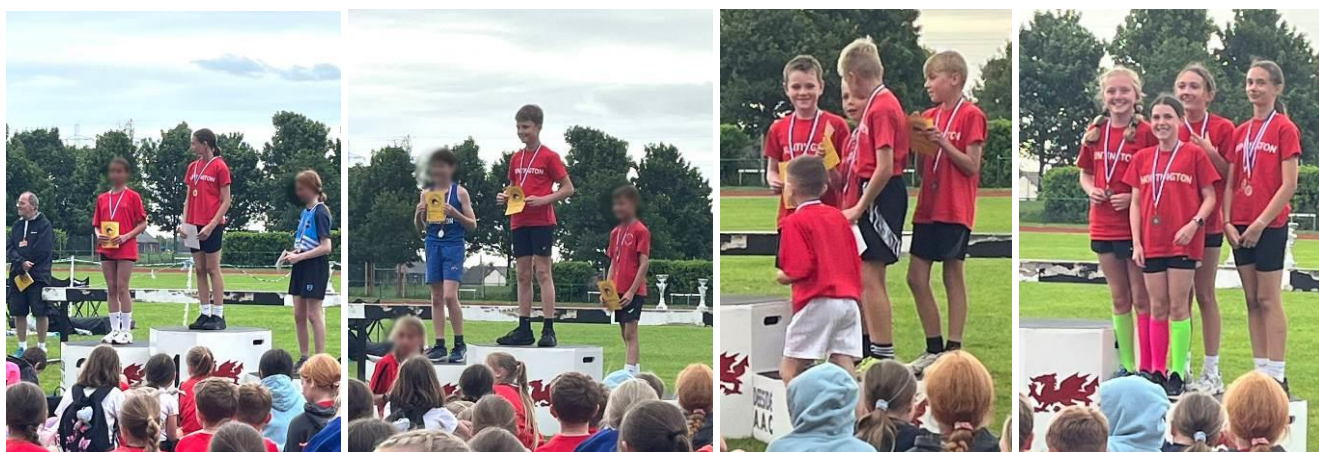
Podium places for our team