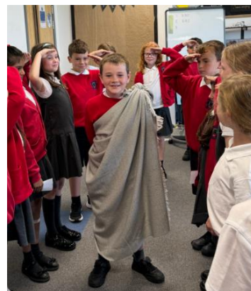
Emperor Claudius in a Y4 Conscience Alley