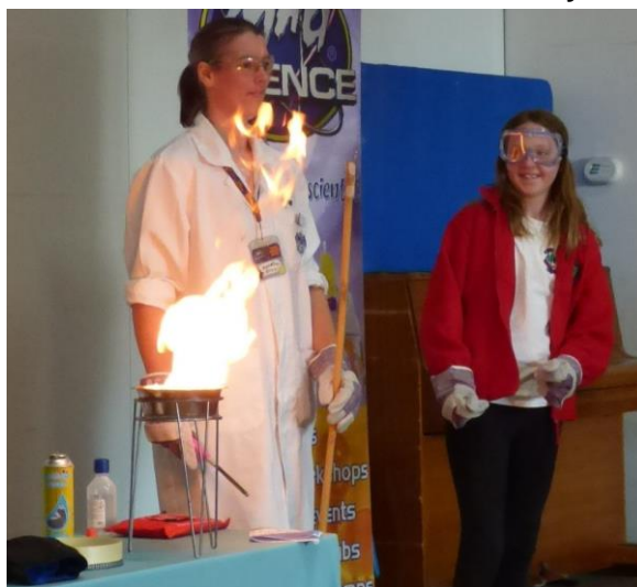
Mad Science assembly