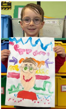
KS1 self portait