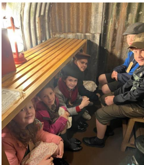
Y6 evacuees seeking safety deep within Stockport Air Raid Shelters