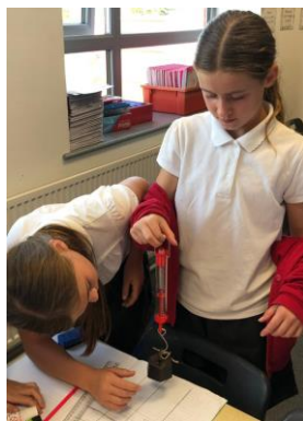
Using force meters in Y5