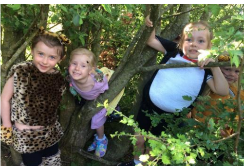
Spotted in the Forest School area on Wear it Wild day!