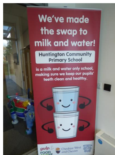
We are a Milk or Water Only school