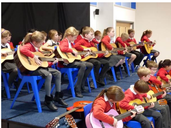
MUSIC: Guitar concert in the hall