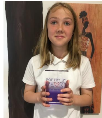
National poetry recitation winner

Speaking and Listening: Effective communication skills are developed during a wide range of activities, from structured role play and class discussions to more formal presentations in assemblies, prepared talks and participation in special events (e.g. No Pens Day , Poetry by Heart (a national competition won in 2021 by our Y6 pupil pictured at right)).