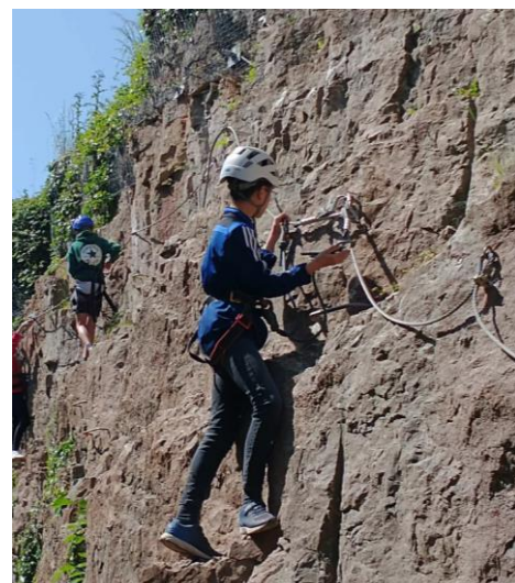
Year 6 residential visit to the Conway Centre