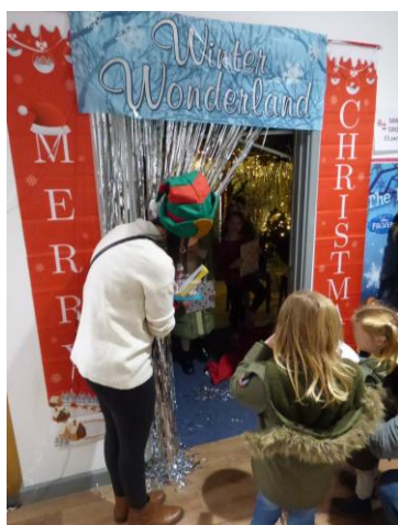
Santa's grotto at the PTA Christmas Fair

We aim to make our school as friendly and familiar for parents as it is for the children. Parents are welcome to help in school in many ways, including working with reading groups, helping with cookery and artwork, and giving specialist talks. Every parent/carer is automatically a member of our Parent Teacher Association (PTA), which plays a vital role in raising funds for additional school resources and also provides a range of entertaining events for both children and parents (e.g. Christmas Fair, below left). The PTA have a lively Facebook page where you can keep up to date with all that's going on.