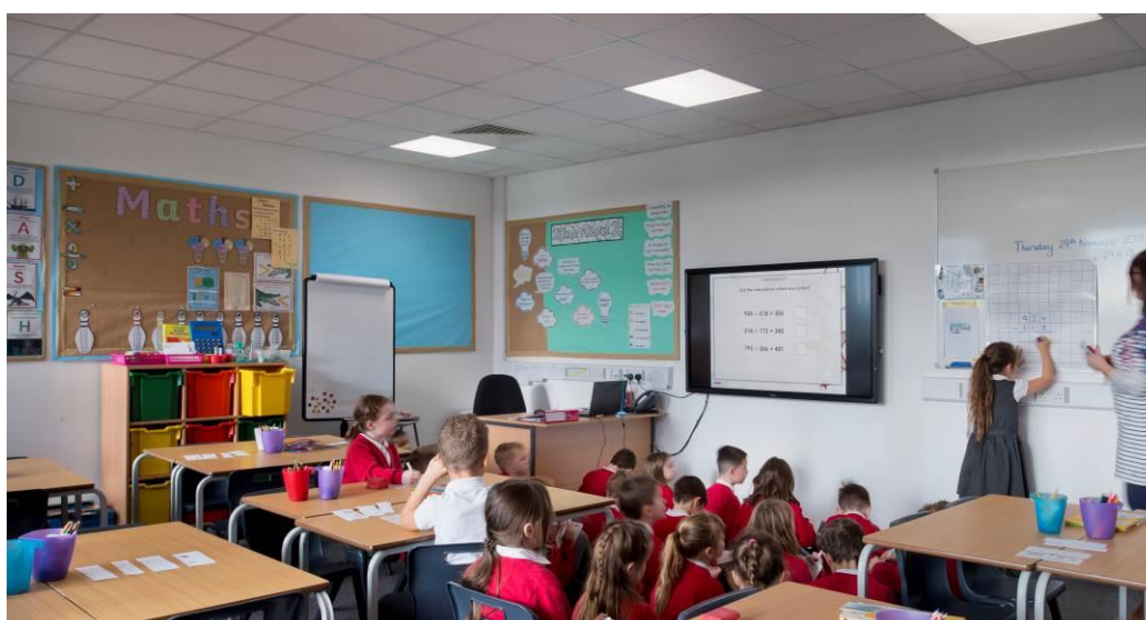
Junior children sharing their learning