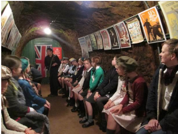
HISTORY: WW2 brought to life for Year 6 at Stockport Air Raid Shelters