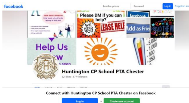
The PTA Facebook page