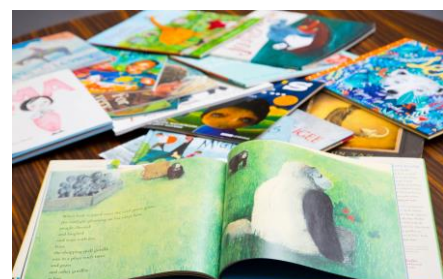
Quality texts to support writing